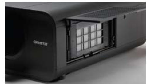
▲ New AutoFilter system reduces maintenance cost – up to 10,000 hours before replacement.

Real color performance is created by the Color Control Device which separates yellow light from red and green panels which also boosts the brightness performance.